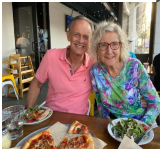
Our 45th anniversary pizza, Sep. 4 in Colorado