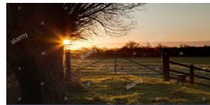
A sunrise reminds me of our Lord's beauty, and what a joy it is serve Him. YOU MAKE THAT POSSIBLE!